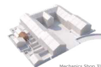
Mechanics Shop 31